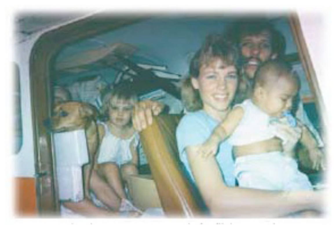
In the plane (Cessna 185) ready to fly to Mexico.